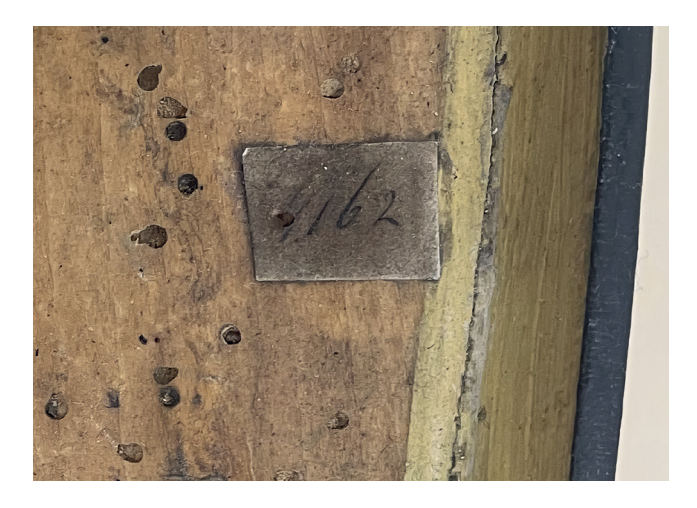
Fig. 8 The foredeck with insect damage and the label with the inventory number, view from above.

nantly in the wood of the deck and the bottom of the masts. Round exit holes with diameters of around 1 mm indicate damage by woodworm (Anobium punctatum). The object number 4162 affixed to the foredeck is perforated by an exit hole. From this we can deduce that the woodworm infestation started or continued after the object entered the Rijksmuseum's collection (fig. 8). The section of the deck immediately aft of the foremast was the worst affected, but belowdeck sections of the masts had also been weakened by woodworm damage (fig. 9).40