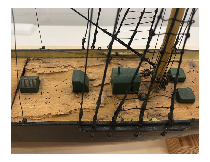
Fig. 11 The consolidated parts of the deck on a support placed back in the hull. Photograph taken during the restoration.

Fig. 12 The section of the deck amidships with the funnel, with a brass knob on top and a brass pawl on the underside.