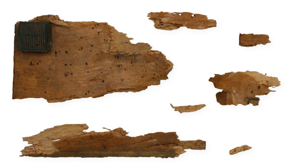
Fig. 9 The loose parts of the deck.

The aim of the restoration treatment was to give the ship model overall stability by repairing the various loose and damaged parts, so that the object could be better interpreted and shown to the public again.<sup>41</sup> The question of