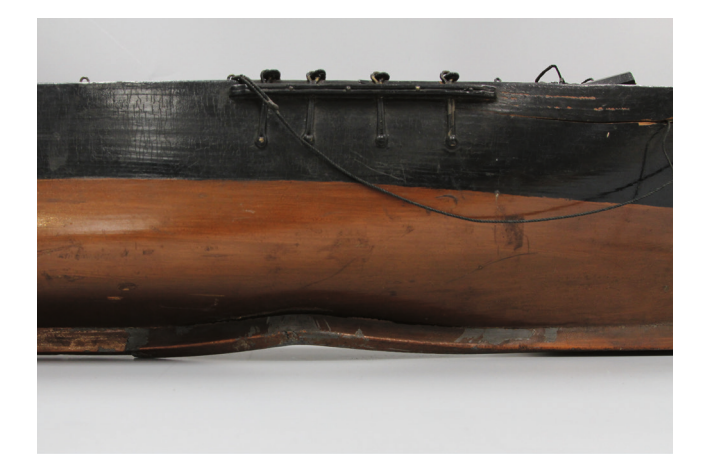
Figs. 7a, b The deformation of the keel, side view and bottom view.

raked, slightly curved stern. Under the stern there is a single two-bladed screw and rudder with a round blade. The hull has the shape of an S-frame and is painted black above the water line. Copper-coloured paint was applied below the waterline. It is impossible to say whether the model represents a ship with an iron or wooden hull. Planks or plating are not accentuated on the solid hull. It could also be an example of a composite construction and that the yellowishbrown colour represents the copper plating of a wooden hull. Beneath the hull there is a lead keel, which must have been put on to counter the high specific gravity. The presence of this weight at the lowest point of the hull