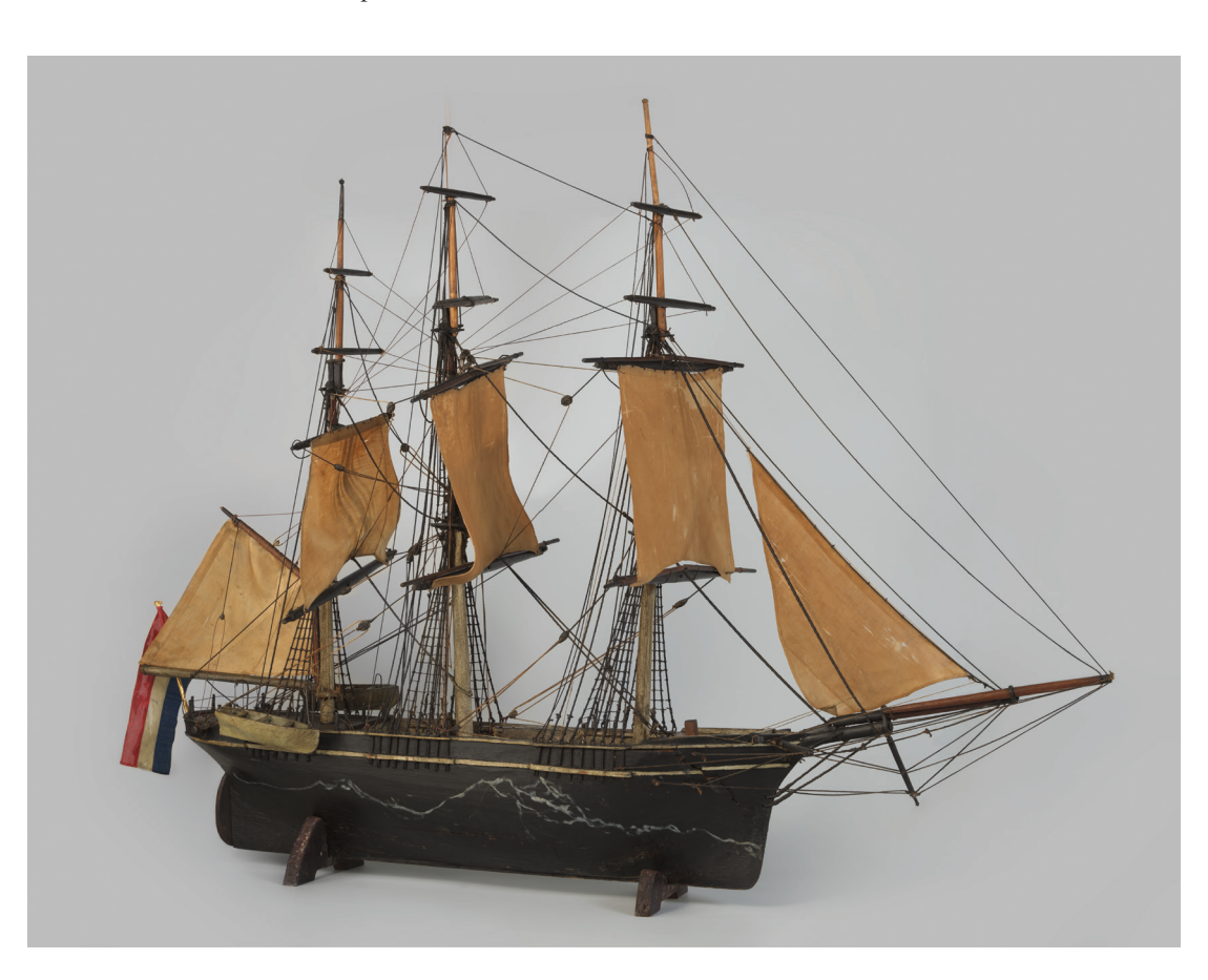
Fig. 16 The merchant frigate, c. 1850-70, from the Van Heemskerck Collection, with painted waves on the hull. Wood, rope and fabric, approx. 106 x 133 x 60 cm. Amsterdam, Rijksmuseum, inv. no. NG-NM-4163.

Painters of seascapes, including Van Heemskerck, often used sketches from life, although they were a secondary source in painting. When it came to technically complicated constructions like sailing ships, though, which continually changed perspective because of the dynamics of the water, artists found that roughly successful scale models were useful aids in depicting the relative proportions of such things as the rigging, masts, sheer and decks. It was difficult for artists, even if they were actually on the spot, to sketch the right moment while vessels were fully deployed or in choppy seas. It was only from a distance or when the sea was