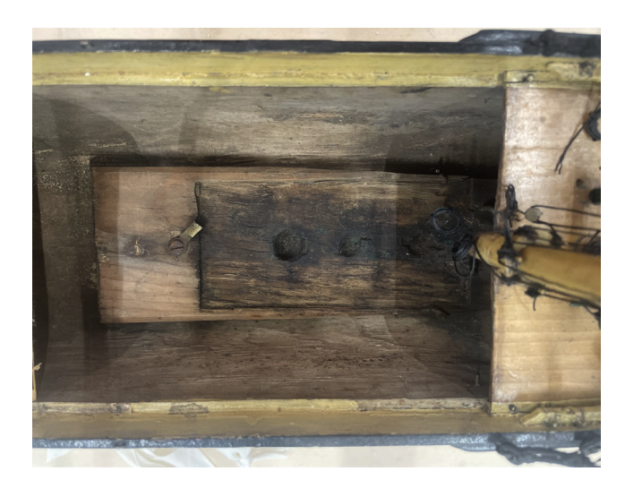
into the significance of the model in Eduard van Heemskerck's painting career strengthened the argument for this decision.

One of the eleven models is a 'modern' screw steamship, which also had sails. The model was badly damaged at some point during the time it spent in the Nederlandsch Museum or in the Rijksmuseum. Since there are relatively few models of screw steamships in public collections, it was decided to restore it, despite the lack of details. The research undertaken parallel to the restoration